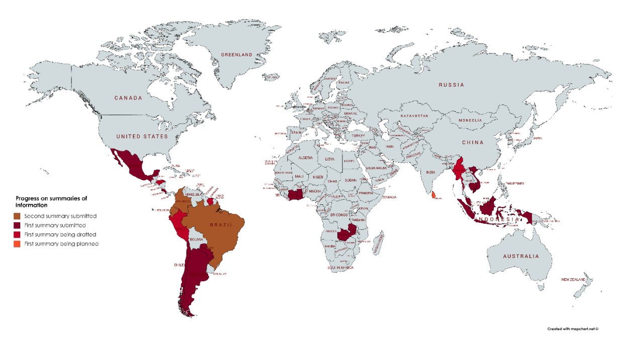
Figure X1. Global progress on summaries of safeguards information at the close of 2019

• Technical and communications materials on REDD+ safeguards were developed, including an <a href="infographic">infographic</a> and the drafts of two technical briefs on SIS operation and the production of summaries of information.