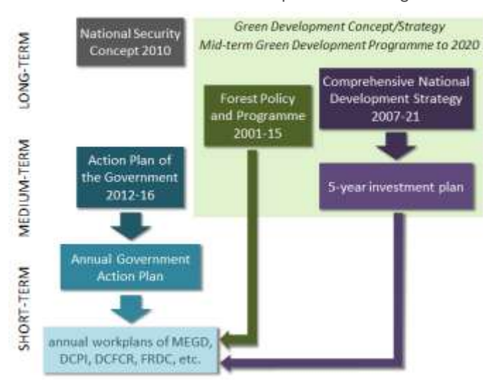
Figure 4: key development strategies and action plans which influence forest workplans and budgets

investment plans. For the environment sector as a whole, a concept for green development and a mid-term green development programme to 2020 are currently under preparation. Specifically in relation to the forest sector, the current National Forest Policy and Programme covers the period 2001-15. It is currently being updated for the first time since 2011.