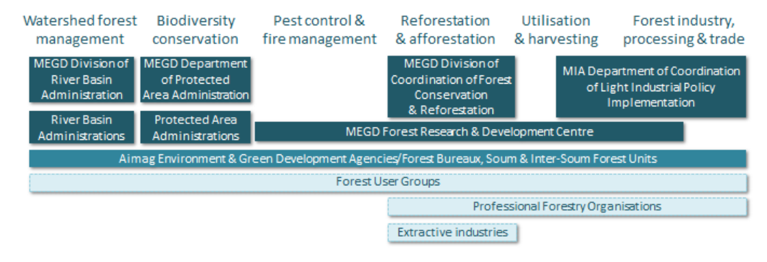
Figure 3: operational responsibilities for SFM implementation and delivery

At an <u>operational level</u>, various national and local agencies have spatial and functional responsibilities for guiding and administering different aspects of SFM implementation and delivery on the ground (Figure 3).