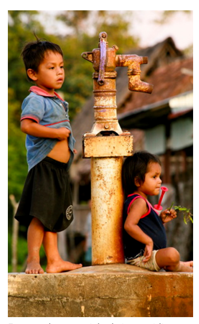
Forests play a crucial role in providing clean water.

As agreed in Cancun in 2010 at the 16th Conference of the Parties to the United Nations Framework Convention on Climate Change (UNFCCC-COP16), a set of seven safeguards are to be promoted and supported when undertaking REDD+ activities. These known as the Cancun safeguards. The UN-REDD Programme has developed a framework and tools to assist countries to take flexible "country approaches" that reflect national circumstances, in responding to the Cancun safeguards and other related UNFCCC decisions<sup>1</sup>. Such a flexible approach helps to reduce REDD+ social and environmental risks and enhance the benefits.