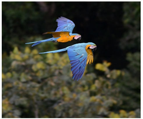
The Cancun safeguards ask that REDD+ actions are consistent with biodiversity conservation.

These components should draw as much as possible on existing PLRs, institutions, processes, procedures and information.