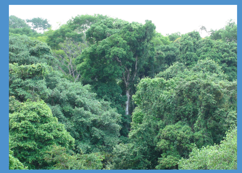
Sustainable forest management for REDD+ in Costa Rica will benefit from a participatory planning process.

Costa Rica received direct support from the UN-REDD Programme for the design of its Safeguards Information System (SIS) through the Programme's Targeted Support mechanism. Costa Rica's National Forest Finance Fund, FONAFIFO, is the government institution responsible for REDD+ in Costa Rica. It has worked to develop the conceptual framework and methodology for the country's SIS. This has involved a consultative process with national REDD+ stakeholders, including Costa Rica's REDD+ Secretariat and representatives from indigenous territories, local communities and relevant institutions. FONAFIFO has also reviewed Costa Rica's legal framework, including relevant PLRs and national planning instruments. Proposals for indicators for the SIS, on how the Cancun safeguards are being addressed and respected, have been presented to, and reviewed by, national REDD+ stakeholders. The UN-REDD Programme support concluded in December 2014, with completion of a detailed SIS proposal.